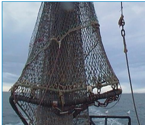
Trawl with restrictors