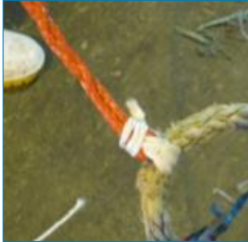
Restrictor fitted with 'clove hitch'