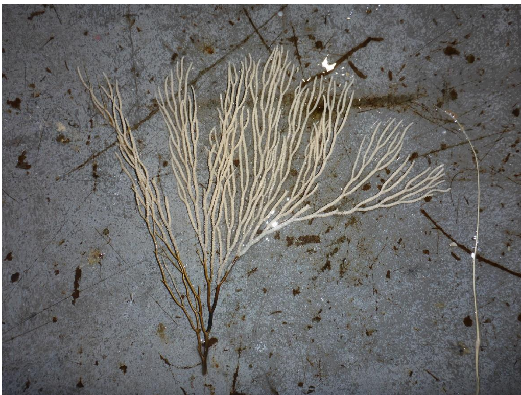
Figure 6: Bryozoan