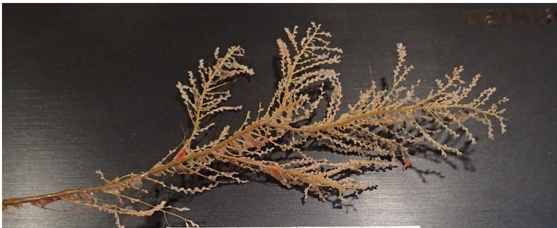
Figure 2: Gorgonians – Order Gorgonacea