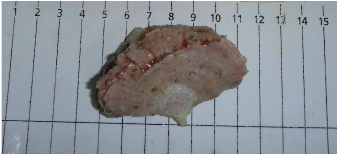
Figure 3: Stony Corals – Order Scleractinia