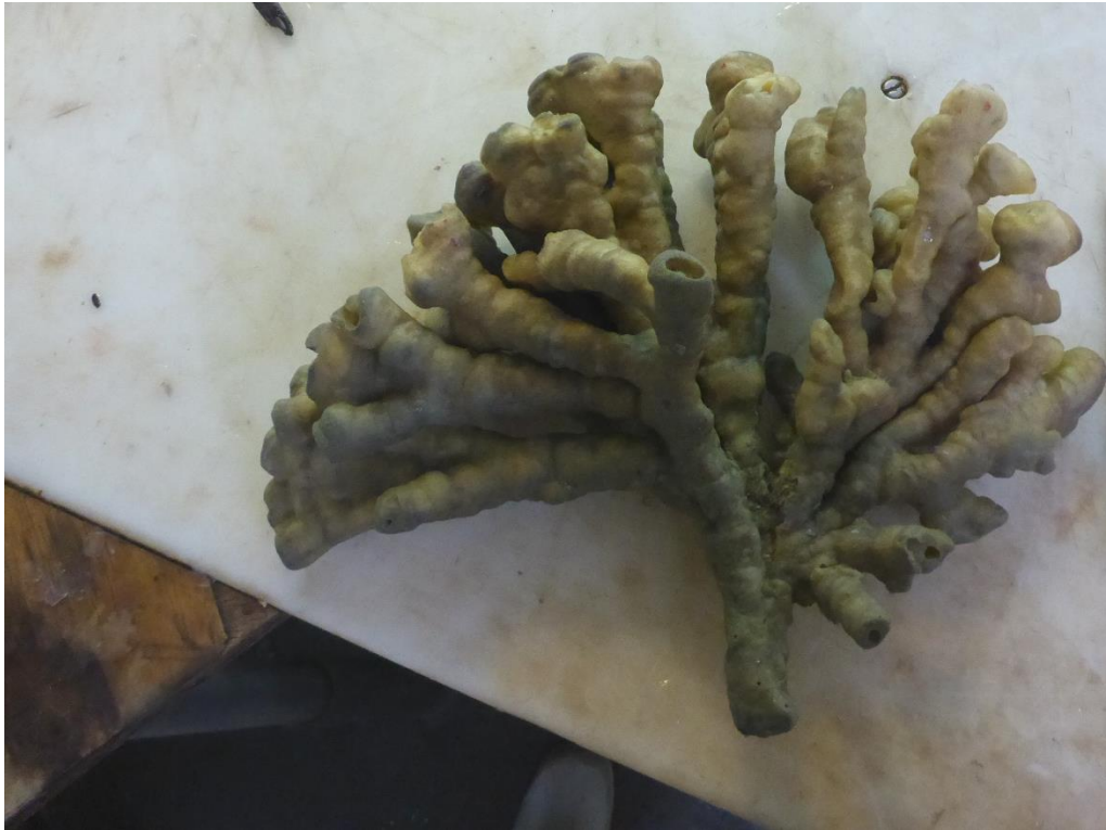
Figure 5: Sponge