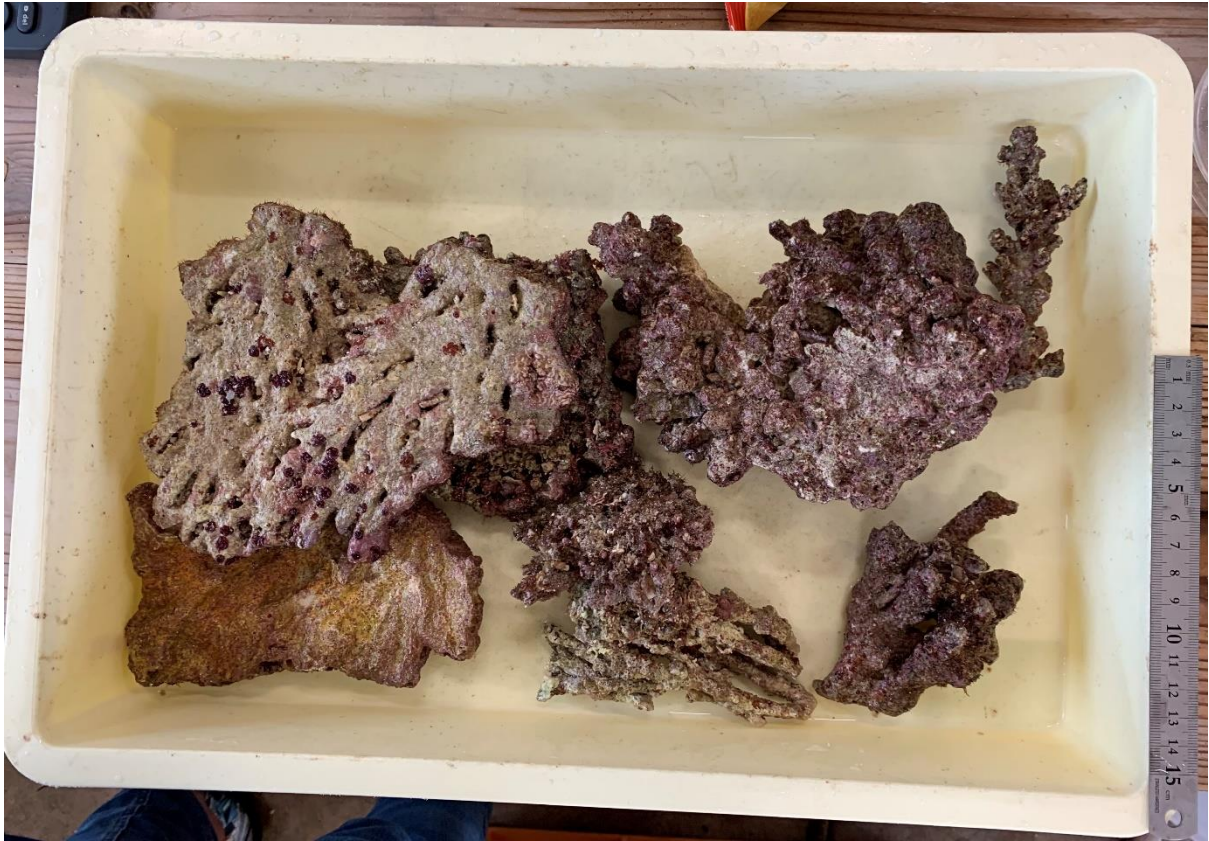
Figure 7: Coral rubble