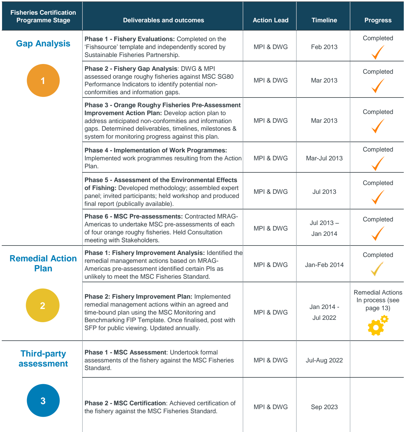
Table 1 Timelines and milestones for the Fisheries Certification Programme for Orange Roughy Mid East Coast (ORH MEC)