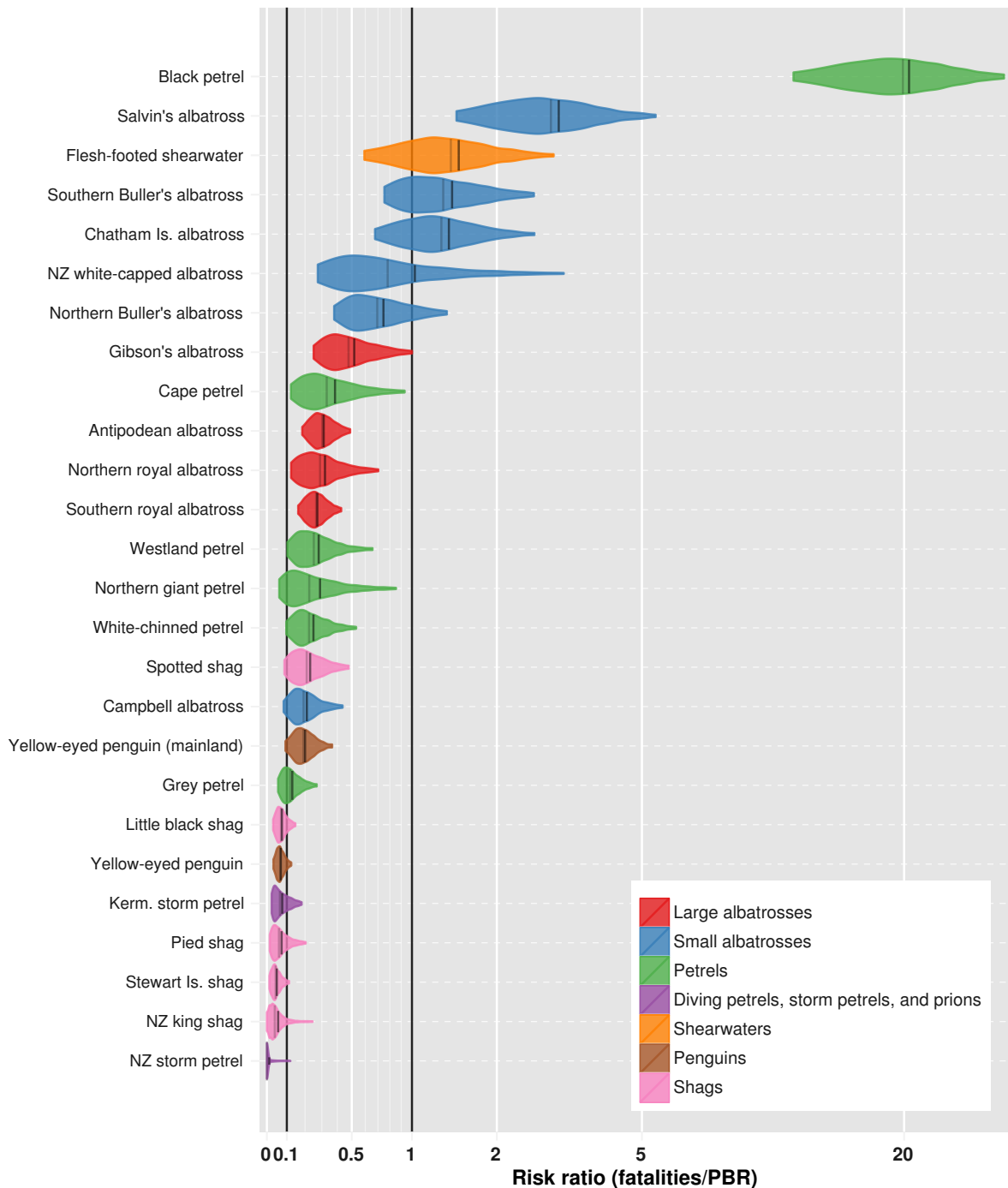
Figure 1: Risk ratio (total annual potential fatalities/Potential Biological Removal, PBR) with the recovery factor f set at 1 for each of the 70 studied species. The risk ratio is displayed on a logarithmic scale, with the threshold of the number of potential bird fatalities equaling the PBR with f = 0.1 and f = 1 indicated by the two vertical black lines, and the distribution of the risk ratios within their 95% confidence interval indicated by the coloured shapes, including the mean risk ratio (solid black line), and median (grey line). Seabird species are listed in decreasing order of the median risk ratio. Species with a risk ratio of almost zero were not included (95% upper limit with f = 1 less than 0.1). The risk ratio of yellow-eyed penguin refers to the mainland population only, based on the assumption that all estimated fatalities were of the mainland population, and the number of annual breeding pairs was between 600 and 800.