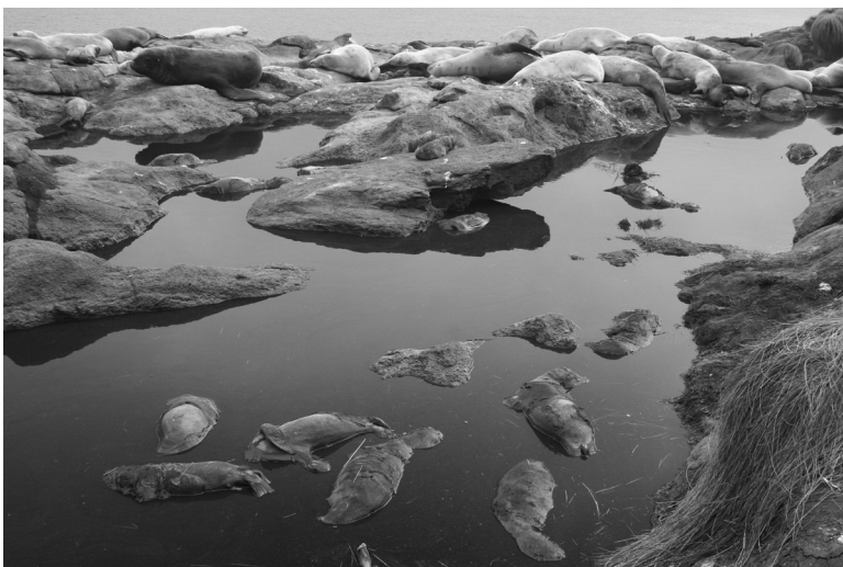
Figure 3. Peat mire at Davis Point, Campbell Island, showing at least 14 dead, bloated sea lion pups that could not be necropsied to determine cause of death.

A common non-lethal condition of necropsied pups was abrasion and ulceration of the carpal (front flipper) area, and also (but less frequently) of the hind flippers