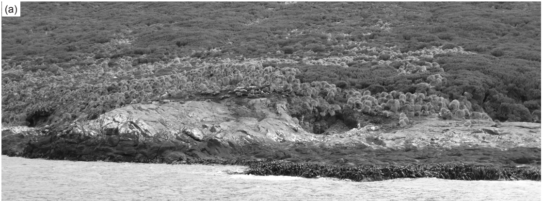
Figure 2. New Zealand sea lion breeding habitat: (a) Davis Point, Campbell Island, (b) Paradise Point, Campbell Island, (c) Sandy Bay, Enderby Island, Auckland Islands.

Forty-nine pups and one adult female were necropsied between 5 and 19 January 2008. As noted in the Methods necropsies could only be carried out on recoverable pups and these may not have been a representative group. The adult female had died as a result of a chronic suppurating infection in the neck, likely to have been caused by a bite wound from another NZ sea lion. The most commonly observed lesions in pup necropsies were the result of