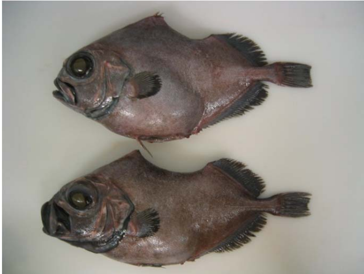
Figure 2: Examples of smooth oreo ( Pseudocyttus maculatus ) from Chatham Rise which have been bitten, but subsequently survived, and the wound healed (these fish were ~30 cm in length). I have seen orange roughy from Chatham Rise with similar wounds, although diet descriptions of potential predators (sharks) on Chatham Rise have not yet found orange roughy as prey. The bites are nearly always in a similar place; I recall seeing only one bite to the posterior anal region. This suggests attack usually from above and behind, or that only those attacked in this way actually survive.

Records of orange roughy being eaten by teleost (bony) fishes are extremely rare. Stevens et al. (2011) reported just one orange roughy eaten in a sample of 18 000 ling, and four eaten in a sample of nearly 106 000 orange roughy (i.e., cannibalised). Stevens et al. (2011) found no orange roughy in the diets of many potential orange roughy predators, including black oreo, alfonsino, sea perch, bluenose, stargazer, hoki, hake, smooth oreo, and barracouta. No orange roughy were found in 11 254 stomachs from 25 species sampled at 200–800 m on Chatham Rise during 2004–2007 (Dunn et al. 2009).