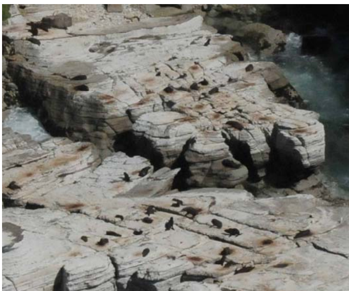
Terrain 2_Rock shelf with some shadow & crevices