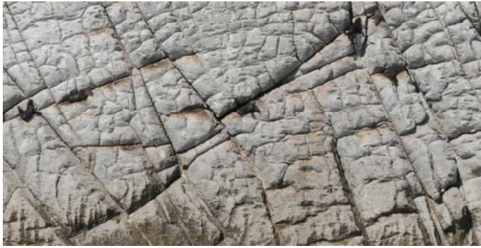
Terrain 2_Rock with shallow crevices