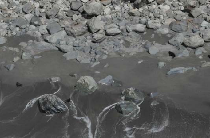
Terrain 3_Sand and rocks