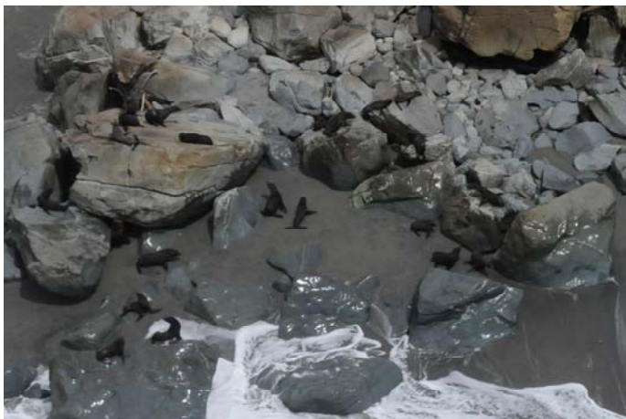
Terrain 2_Sand rock & boulders