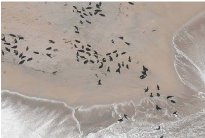
Terrain Category 1 — sandy beach