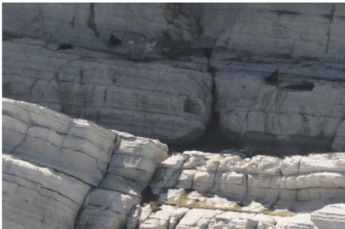
Terrain 3_Rock shelf