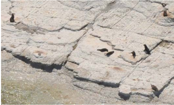
Terrain Category 1 — flat rock shelf