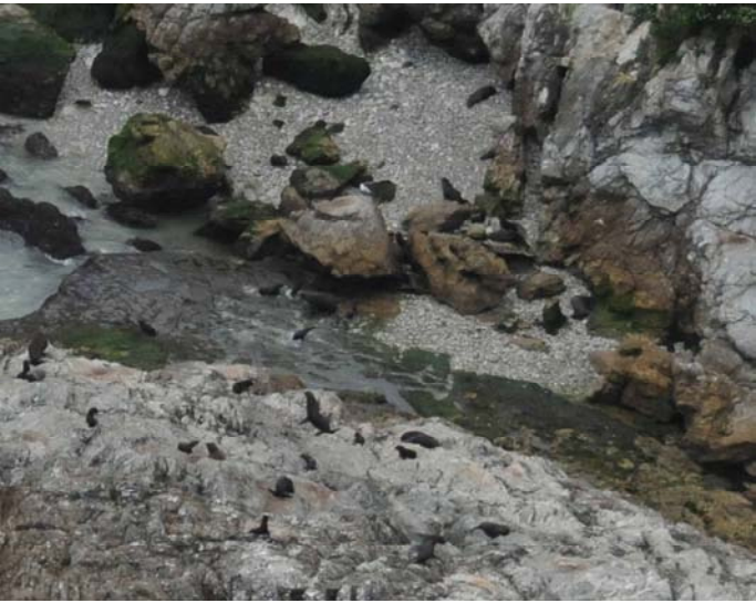
Terrain 4_Rock & boulders