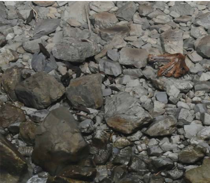
Terrain 4_Rocky boulders