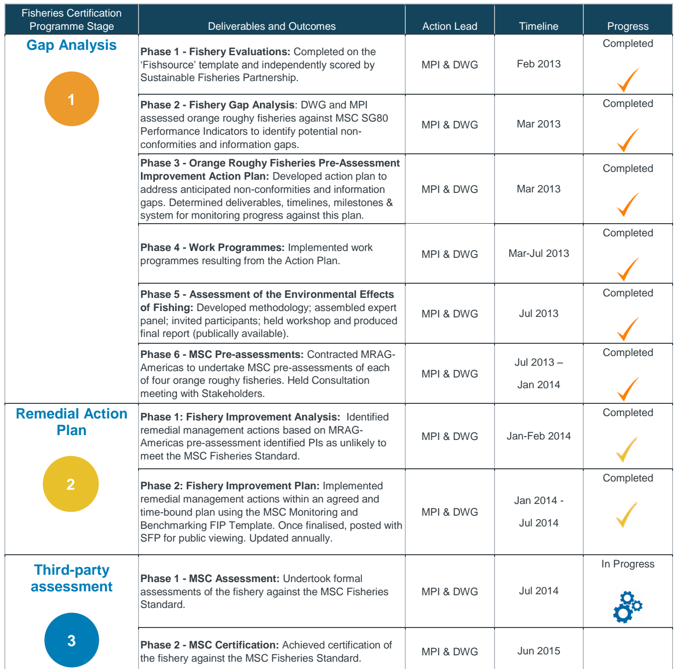
Table 1 Timelines and milestones for the Fisheries Certification Programme for Orange Roughy North West Chatham Rise (ORH NWCR)